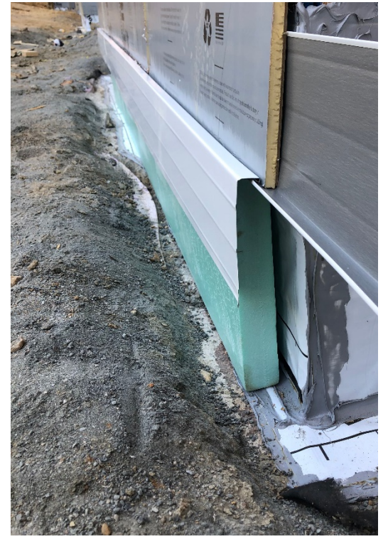
Figure 5: Slab Edge insulation with flashing and protection.